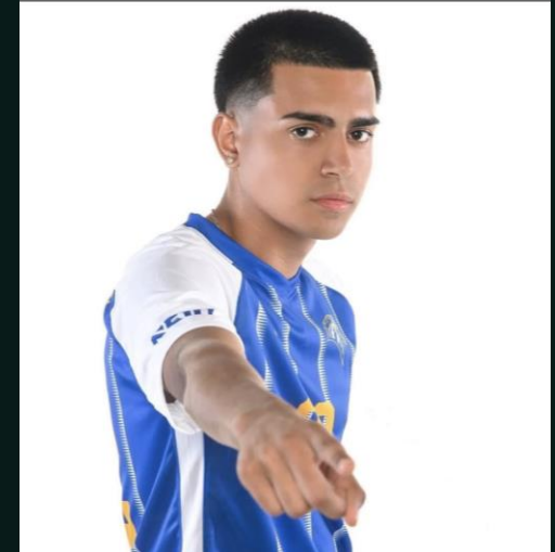
AMAR SUMRA E-COMMERCE